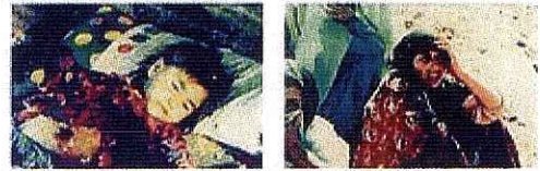
07 August .1988 Sirmak-Merkez / Dereler Village in south Eastern Turkey 15 people were murdered (7 children, 2 Women, 6 Men) by PKK in a rocket attack on innocent civilian targets