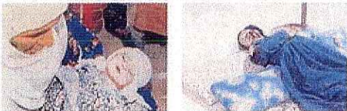
08 July 1987 Mardin-Idil / Peçenek Village in south Eastern Turkey 16 Innocent civilian people were murdered by PKK ( 10 children, 2 Women, 4 Men)