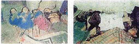
24 January 1987 Mardin-Midyat / Basyurt Efeler Village in south Eastern Turkey 11 Innocent civilian people ( 7 children, 1 women, 3 men) were murdered by PKK