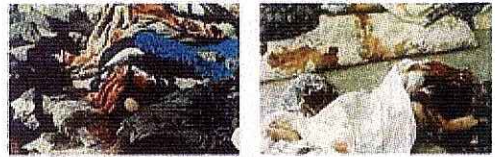
20.June.1992 Batman-Gercus / Saki Village in south Eastern Turkey 10 Innocent civilian people (7 children, 1 Women, 2 Men) were murdered by PKK