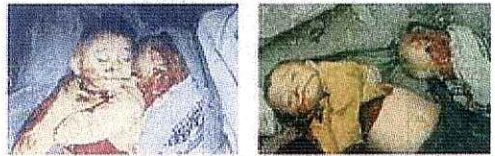
04.October.1993 Siirt-Sirvan / Daltape Village in south Eastern Turkey 33 Innocent civilian people(10 children, 7 Women, 16 Men) were murdered by PKK