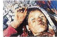
10.June.1990 Sirmak.Güçlökönak / Çevrimli Village in south Eastern Turkey 27 Innocent civilian people were murdered by PKK (11 children, 7 Women, 9 Men)